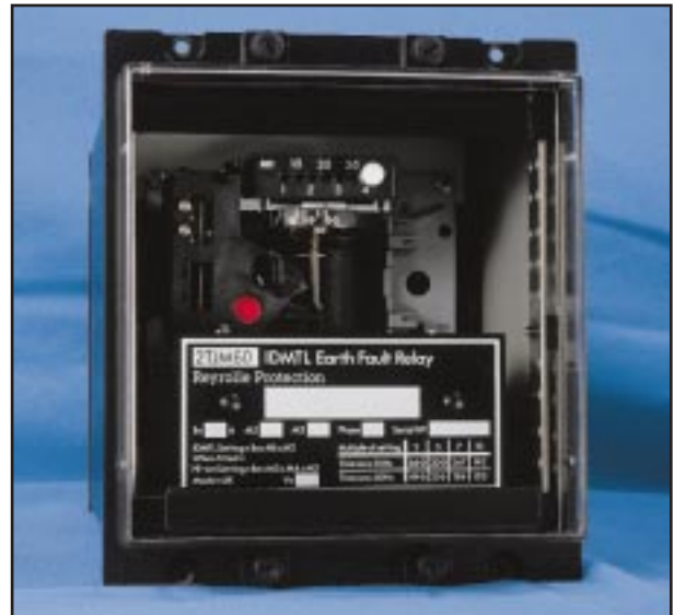
Type 2TJM60 relay in a modette case

Two normally open contacts are provided, one for trip duty of the bridging type and the other a series operated reed relay energised by the circuit breaker trip coil current. If the trip coil takes less than 0.8amp a voltage