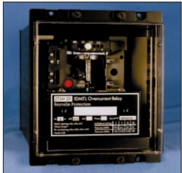
Type 2TJM20 single pole relay in a size 6 case

Two normally open contacts are provided of the bridging type, the operating arm being driven by a cam track at the hub of the