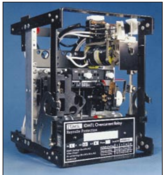
Type 2TJM14 single pole relay in a vedette chassis

The electro-magnetic system comprises primary and secondary magnets arranged with four air gaps each contributing to the driving torque. The primary coil, with tappings to permit the selection of a fault setting by a plug-bridge, energises the primary magnet and a secondary winding which energises the secondary magnet. The plug-bridge automatically selects the highest setting when