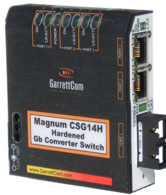
Hardened for Factory Floor