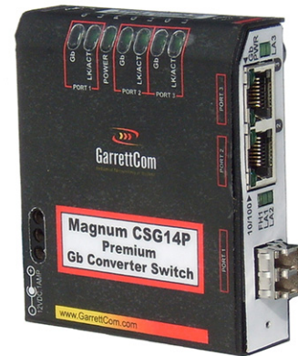
Premium-rated for Outdoors

Combine a Gb Fiber Media Converter and a two-port 10/100/1000 copper Switch, and you have the Magnum CSG14 Converter Switch™, a new high-speed flexible edge-of-the-network industrial Ethernet product. Add in Gb fiber port choices for all multi-mode and single-mode Gb fiber connector types plus DC or AC input power selection, and the metal case and configuration choices you expect from Magnum products, and you have the answer to many Gigabit connectivity applications in industrial networks.