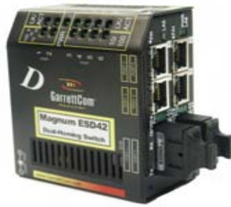
Office and Wiring Closet