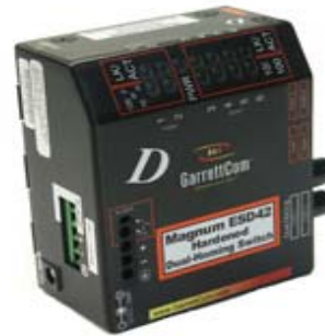
Hardened for Factory Floor