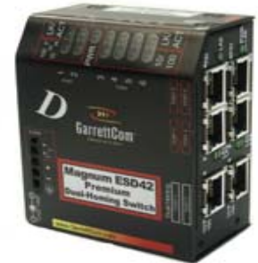
Premium-rated for Outdoors

Magnum™ ESD42 Dual-Homing Switches bring redundancy to the network edge.